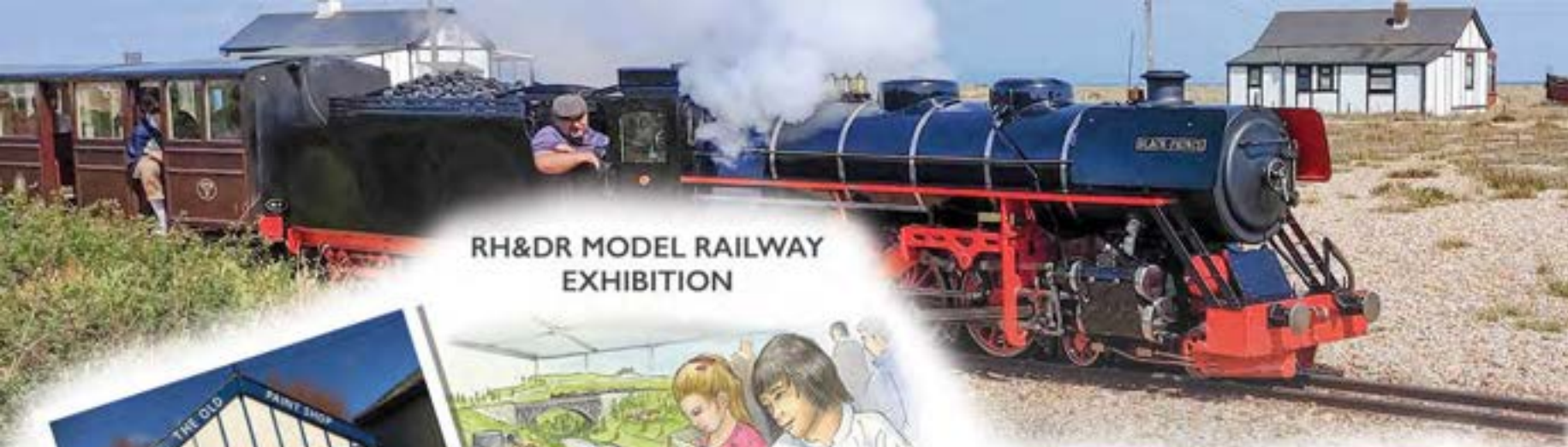
RH&DR MODEL RAILWAY EXHIBITION