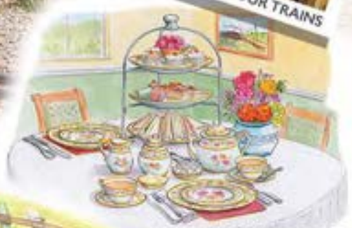
HYTHE TEA ROOM open from 26th March