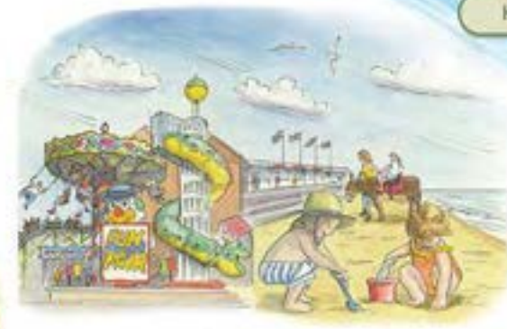
DYMCHURCH BEACH & FUNFAIR